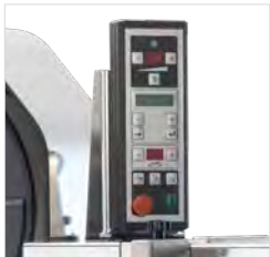
Simple adjustments, pivotal control panel