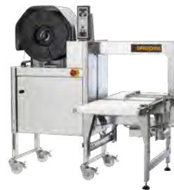
SMG 75i With driven belt conveyor for integration into fully automatic lines