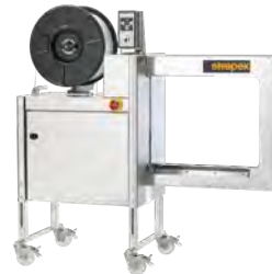
SMG 65i As stand alone machine or for integration into conveyor systems